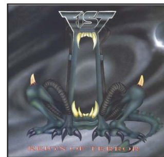
REIGN OF TERROR 1993 Magada World