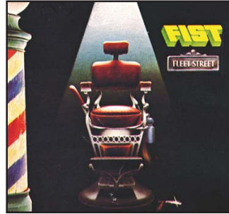
FLEET STREET 1981 A&M Records World