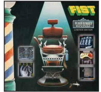
FLEET STREET REVIVAL 2001 Ronch Music World