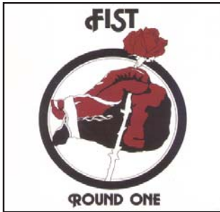
ROUND ONE 1979 Magada World