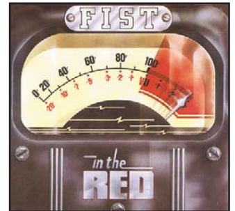
IN THE RED 1982 A&M Records World