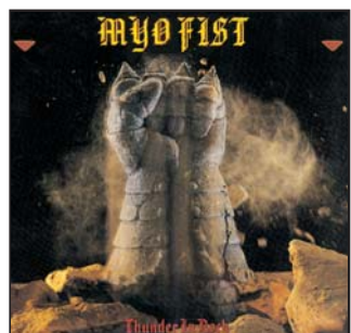
THUNDER IN ROCK 1981 A&M Records Europe