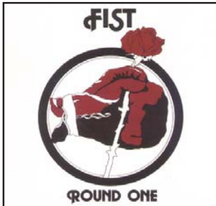
ROUND ONE 1979 Magada World