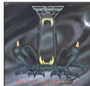
REIGN OF TERROR 1993 Magada World