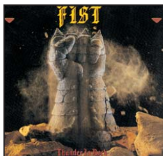
THUNDER IN ROCK 1981 A&M Records World