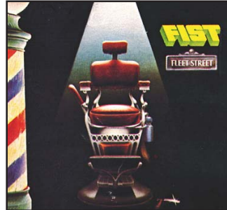
FLEET STREET 1981 A&M Records World