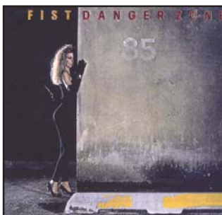
DANGER ZONE 1985 Cobra / A&M Records World