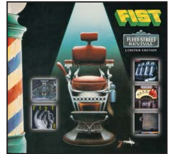
FLEET STREET REVIVAL 2001 Ronch Music World