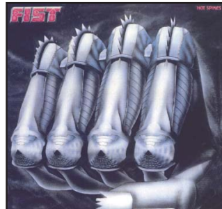
HOT SPIKES 1980 A&M Records World