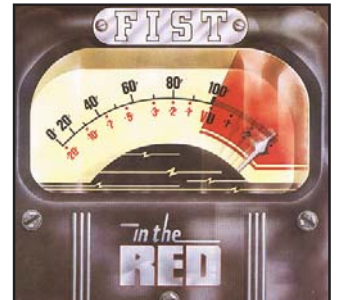
IN THE RED 1982 A&M Records World